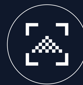
1920*1080 Screen resolution