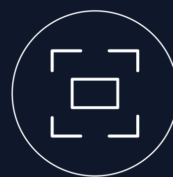
21.5 inch screen