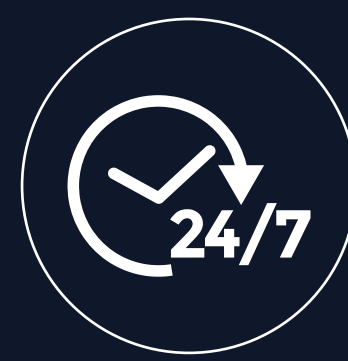
Running 24/7 without affecting reliability