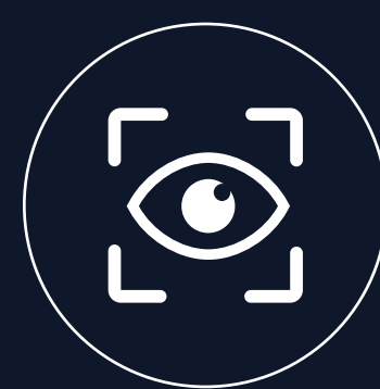
250cd/m 2 Brightness