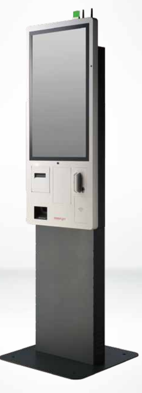
Single Sided Floor-standing