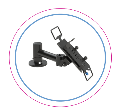
PAYlift with straight arm including MultiGrip Plate