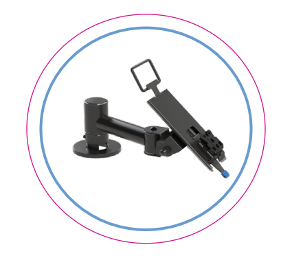
PAYlift with straight arm including MultiClip