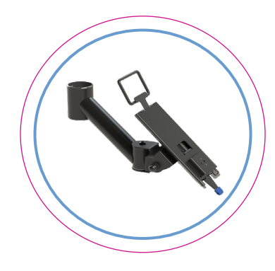
PAYlift with Angled Arm