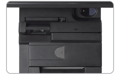
Optional Built-in MSR Fingerprint Sensor and RFID Reader