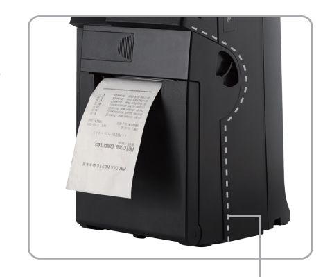
Detachable Receipt Printer •

The HS-6500 Series integrates the most widely used peripherals including 3" thermal printer, MSR, fingerprint sensor, 2D barcode scanner and 2^{nd} customer display to support your daily POS operation. The detachable modularized design allows quick access to the components, enabling fast and easy service and upgrades.