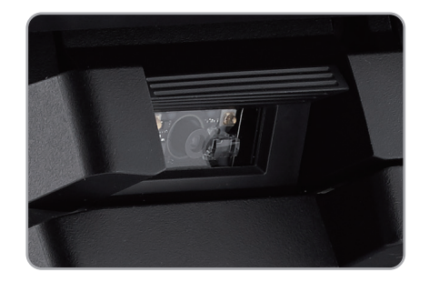
2D Barcode Scanner

Dressed from head to toe in timeless black or white color, the only trend that never goes out of style, and with stylish touches added throughout, the HS-6500 Series is not just a piece of machinery, it is an elegantly crafted piece of art that looks right at home in any store decoration.